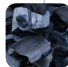
BOSSA NOVA Hair SPA