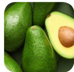
XOTE Post chemistry